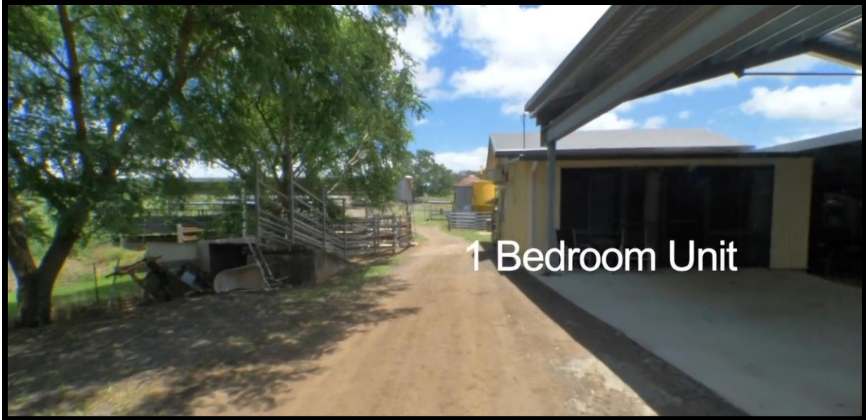
1 Bedroom Unit