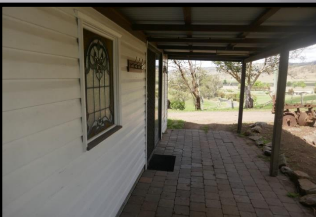
1 BEDROOM GRANNY FLAT