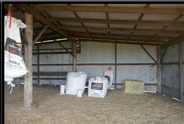
HAY & STORAGE SHED