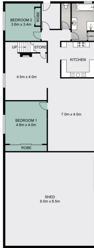
Shed Dwelling Downstairs